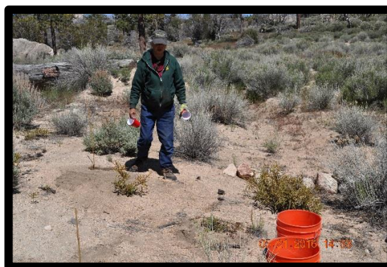
Volunteers planting native species on the San Bernardino National Forest