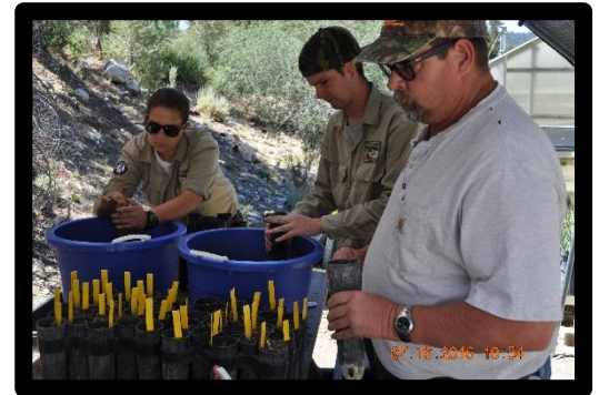
Volunteers transplanting Milkweed