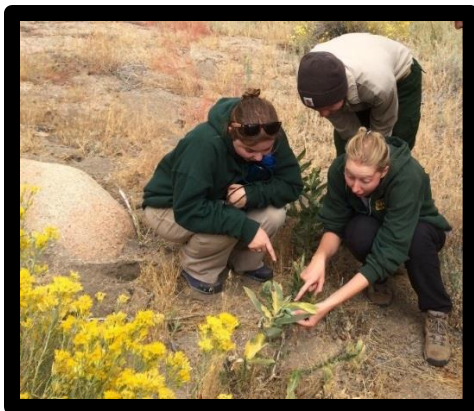
Staff locating caterpillars 9/21/16